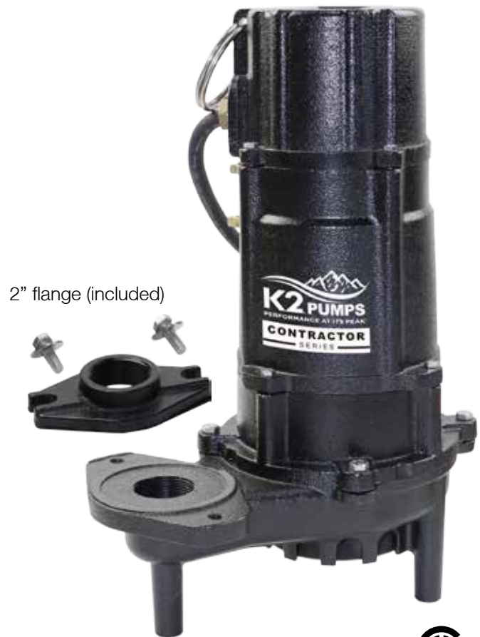
2" flange (included)